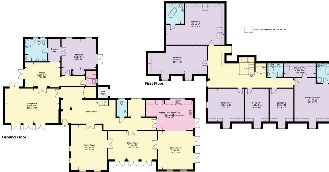
Illustration for identification purposes only, measurements are approximate, not to scale. floorplansUsketch.com © (ID1014261)